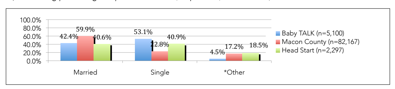
Table 4: Income Level of Mother (*Remaining percentages reported Divorced, Separated, or Widowed)

Table 4 provides an illustration of varying income levels across Baby TALK participants and Head Start participants. Parallel to Head Start trends, a high percentage (34.1%) of Baby TALK participants live on less than $10,000 in annual income. Baby TALK participants in other income categories remained behind Head Start income rates. Interestingly, the Baby TALK findings suggest the program is serving a wide range of participants with varying degree of needs. To illustrate, the Baby TALK model identified families making more than $50,000 a year (24.1%) who needed and accessed early intervention services.